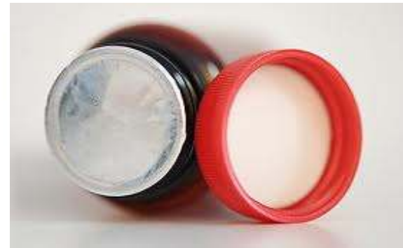
Semi Automatic Induction cap Sealing Machine