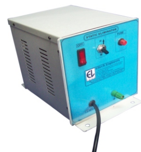
eltech-331 Power Unit